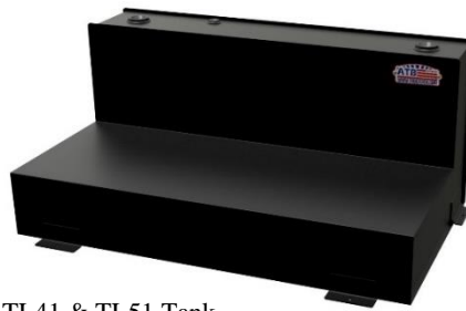
TL41 & TL51 Tank