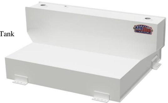
TL42 & TL52 Tank

Tanks should be mounted to ATB mounting installation guideline. Failure to properly