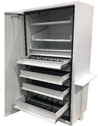
SRT Models with Drawers and Shelves