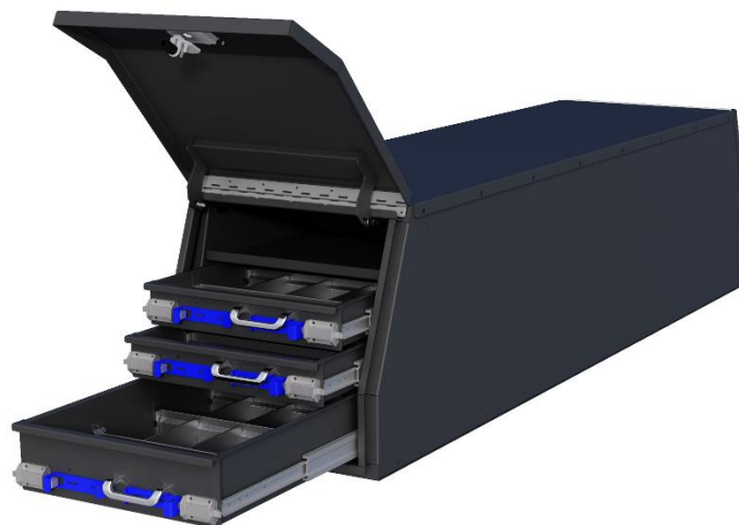
CGD Boxes – Angled Box Mates with DU41 Boxes