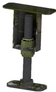
M3810P Bottom Leg Support