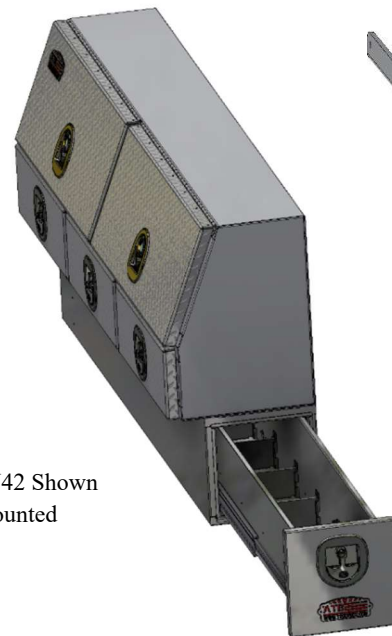
MBFU61-Series Top Box Extension Mounting Angle Bracket