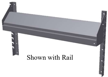
Shown with Rail