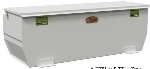
A-TT51 or S-TT41 Tank