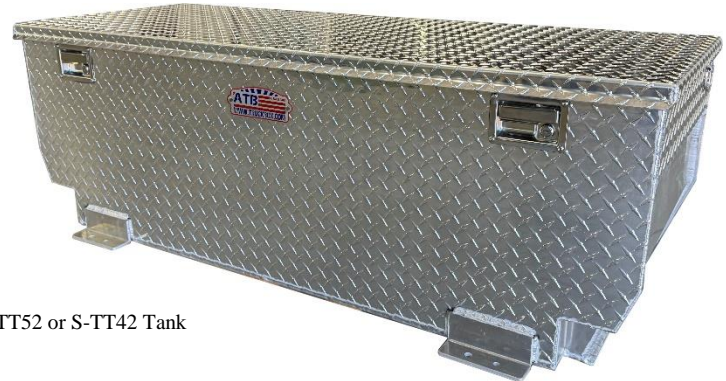
A-TT52 or S-TT42 Tank