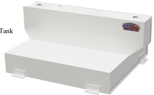
TL42 & TL52 Tank

Tanks should be mounted to ATB mounting installation guideline. Failure to properly