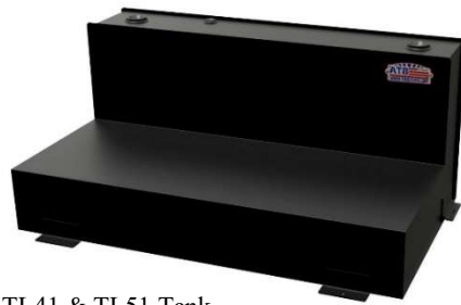
TL41 & TL51 Tank