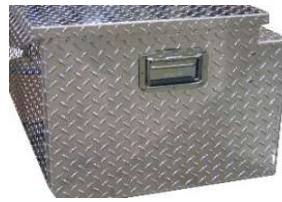
End View Showing Inset (Offset) and with Optional Handle