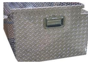
End View Showing Inset (Offset) and with Optional Handle