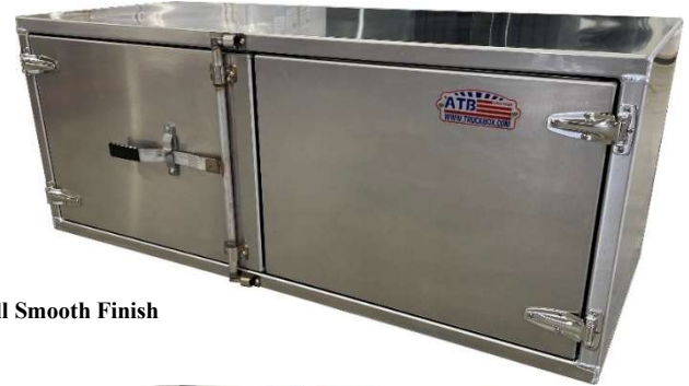
All Smooth Finish