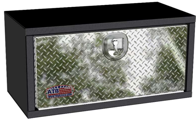
Powder Coated Body