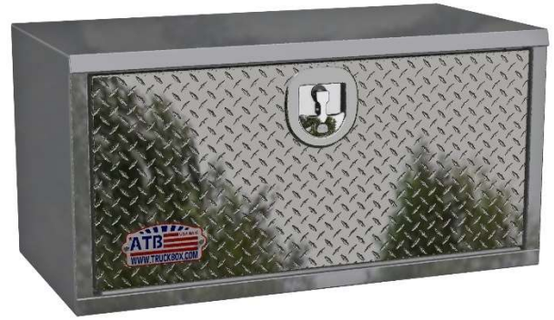
Diamond Tread Door