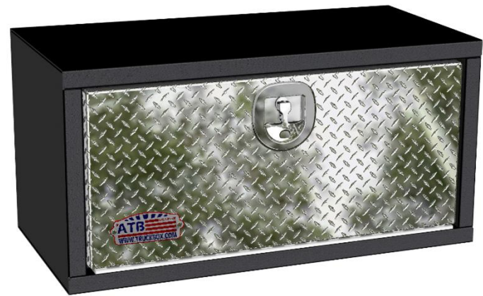
Powder Coated Body

Note: Toolboxes less than 48 inches wide come standard with one lock only; however, we can make configuration changes if specified.