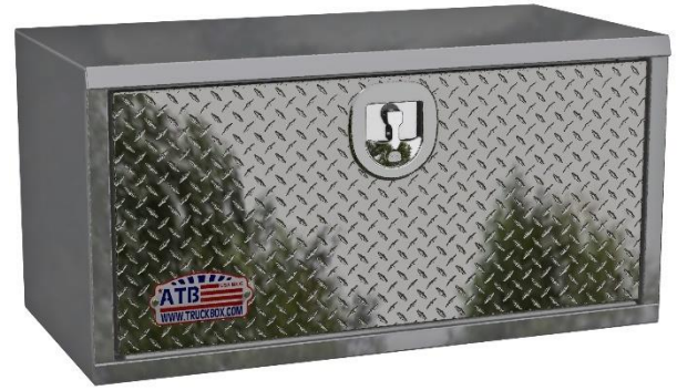
Diamond Tread Door