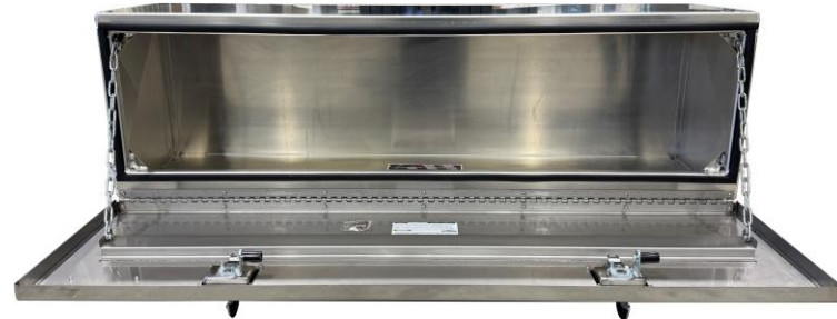
Mirror Finish Door