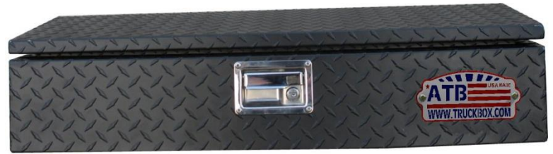
SC31 Front Box