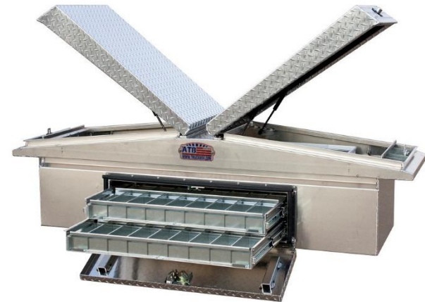
With Option Drawer(s)