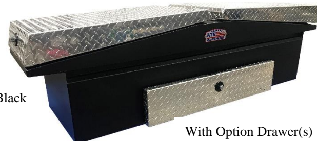
Powder Coated Black