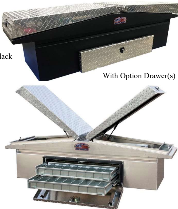
With Option Drawer(s)