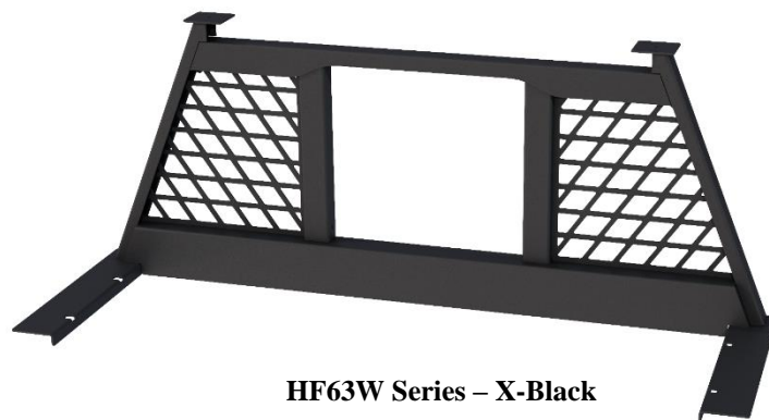
HF63W Series – X-Black