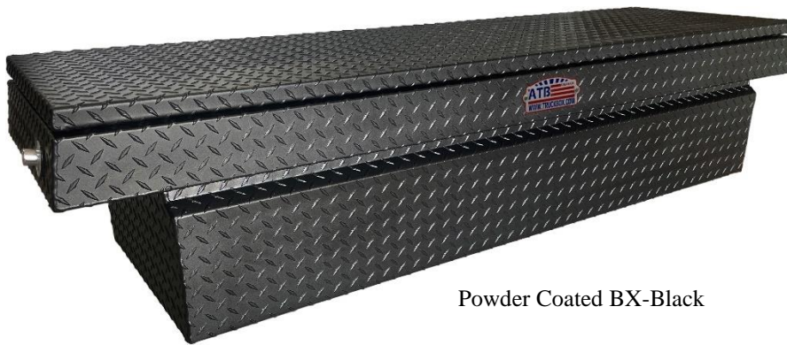
Powder Coated BX-Black