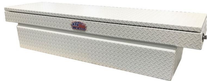
Powder Coated WX-White