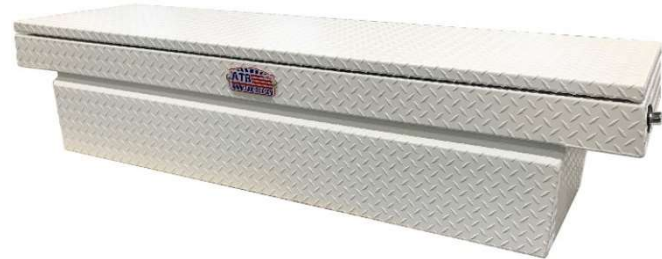
Powder Coated WX-White