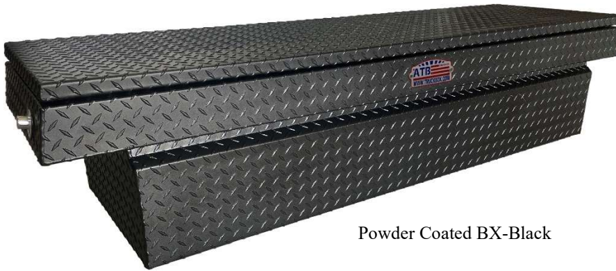
Powder Coated BX-Black