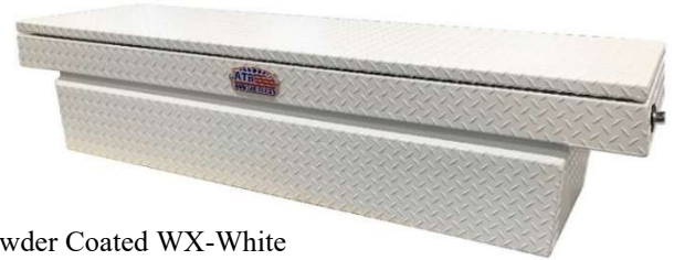
Powder Coated WX-White