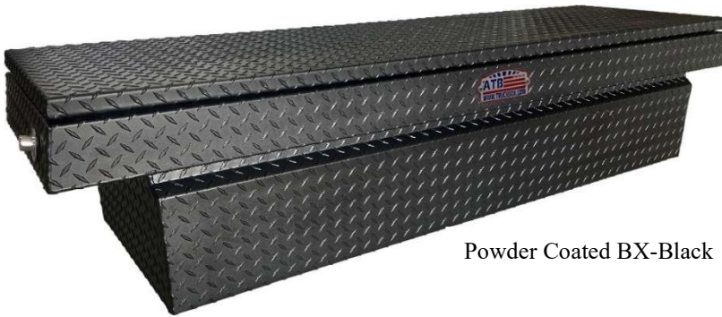
Powder Coated BX-Black