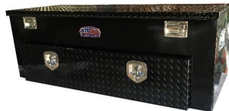
ATC41P Powder Coated Black