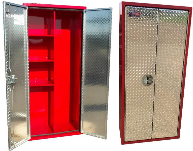
AGC41-651830DD-SOT Powder Coated Red