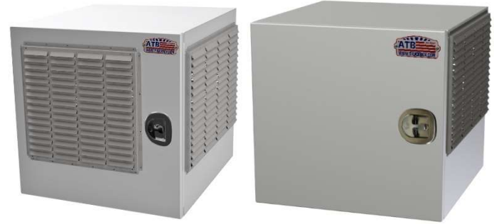
Picture Shown with Front Grill which is optional.