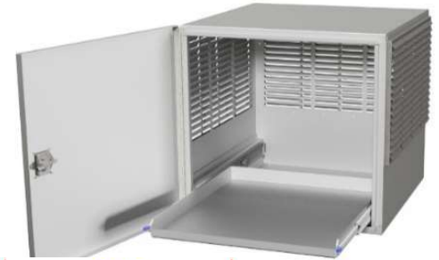
Aluminum Grill Covers Comes Standard with Box