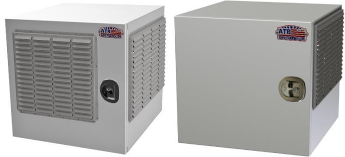
Picture Shown with Front Grill which is optional.