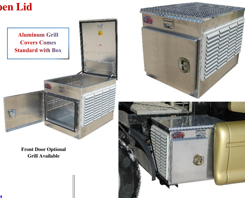
Front Door Optional Grill Available

Aluminum Grill Covers Comes Standard with Box