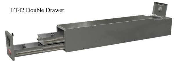
FT42 Double Drawer