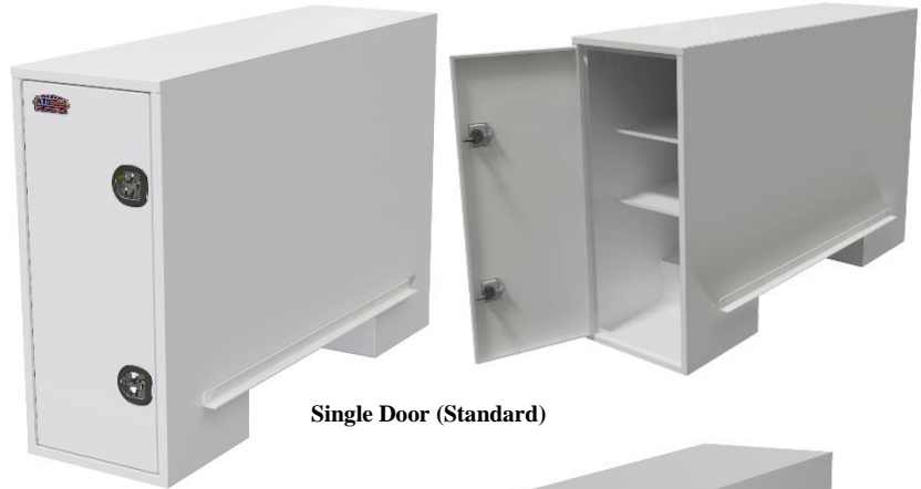
Single Door (Standard)