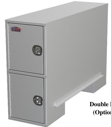
Double Door (Optional)