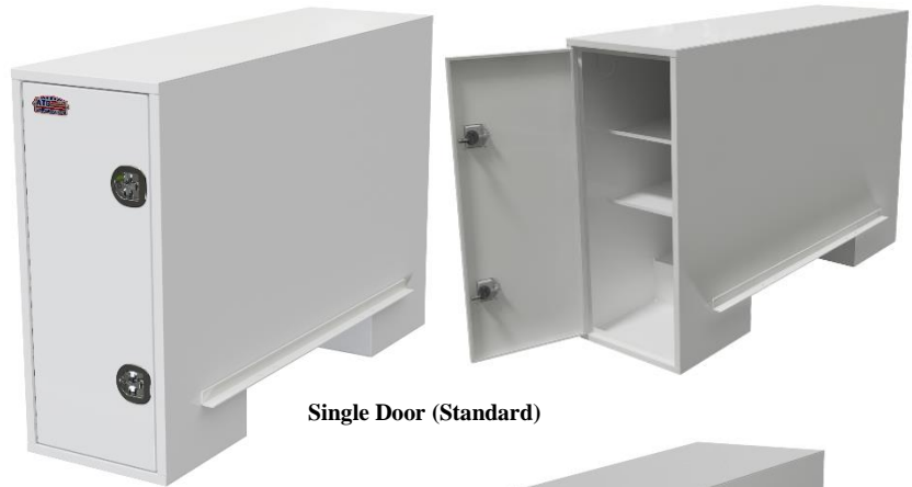
Single Door (Standard)