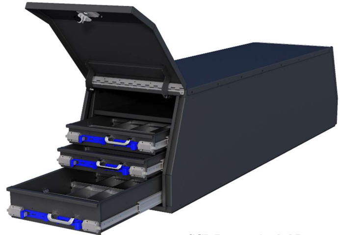
CGD Boxes – Angled Box Mates with DU41 Boxes