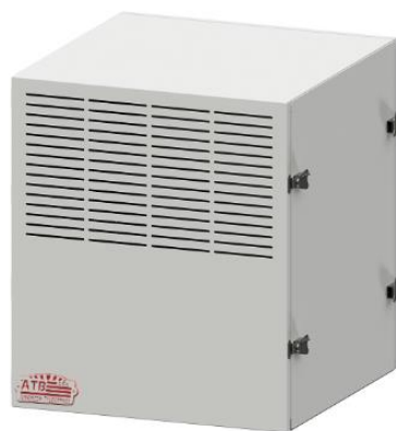
Door with Vent Holes