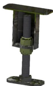
M3810P Bottom Leg Support