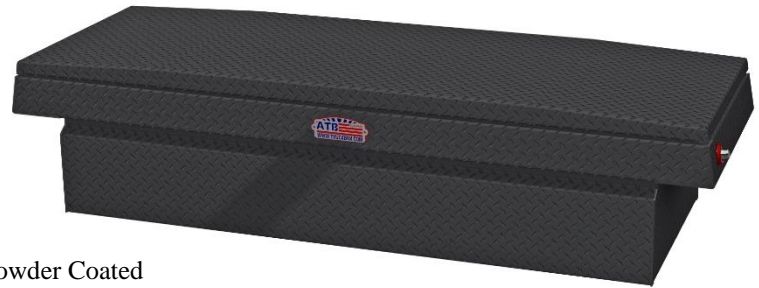
Powder Coated BX-Black