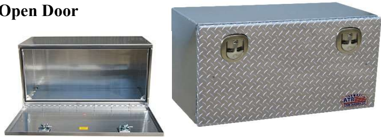
Diamond Tread Door