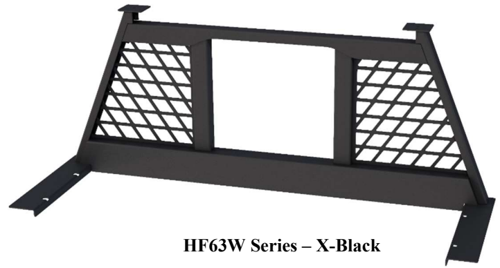
HF63W Series – X-Black