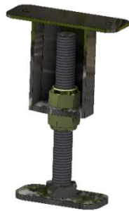
M3810P Bottom Leg Support