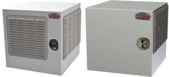
Picture Shown with Front Grill which is optional.