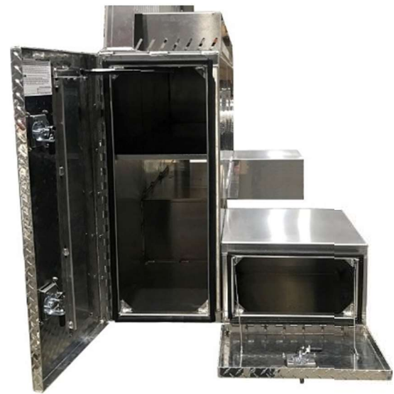
Shown with optional Side Boxes.