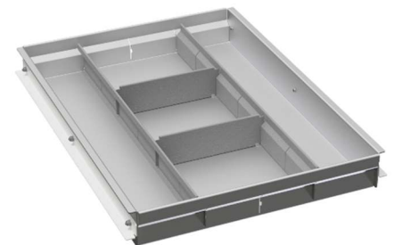
Cross Box Tray