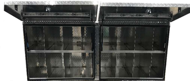
Aluminum Top Hinged with Storage Bins