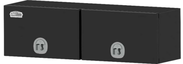
Top Hinged Box